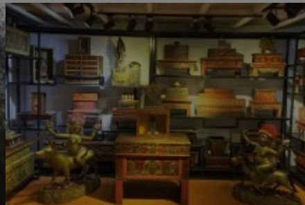
The Mongolian Ethnographic Ger

Museum is located in Ulaanbaatar, the capital of Mongolia, covering 0.8 hectares of land. The Museum has long been dedicated to research, arrangement, study, protection and dissemination of Mongolian traditional culture . Up to now, more than 15,000 objects covering a period as far back as the 17th century are stored in the Museum, including wooden collections, household utensils, traditional clothing, harnesses, musical instruments, religious objects, sutras, etc. The Museum is also dedicated to protecting and passing on Mongolian intangible cultural heritage , through the display of Mongolian tea culture and wine culture production techniques. Since its establishment, the Mongolian Ethnographic Ger Museum has held various cultural exhibitions and has exhibited in China, South Korea and other countries and regions, bringing Mongolia's colourful and outstanding traditional nomadic culture to the public worldwide . This serves to present the invaluable importance of nomadic culture to younger generations, enabling them to understand the history and culture of Mongolia, and has also made positive contributions to cultural exchange between countries. Permanent collections: household utensils, wooden collection, Buddhist and shamanic religious objects.