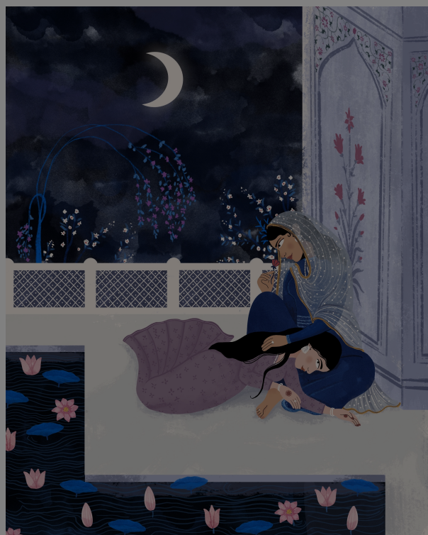
Moon Song by Reya Ahmed

The virtual format also permits creative practitioners to connect with others across the world. There is an unprecedented level of access and exposure that this format facilitates. It is vital to leverage these possibilities to enrich one's practice, and also to document one's practice in web-accessible and shareable formats.