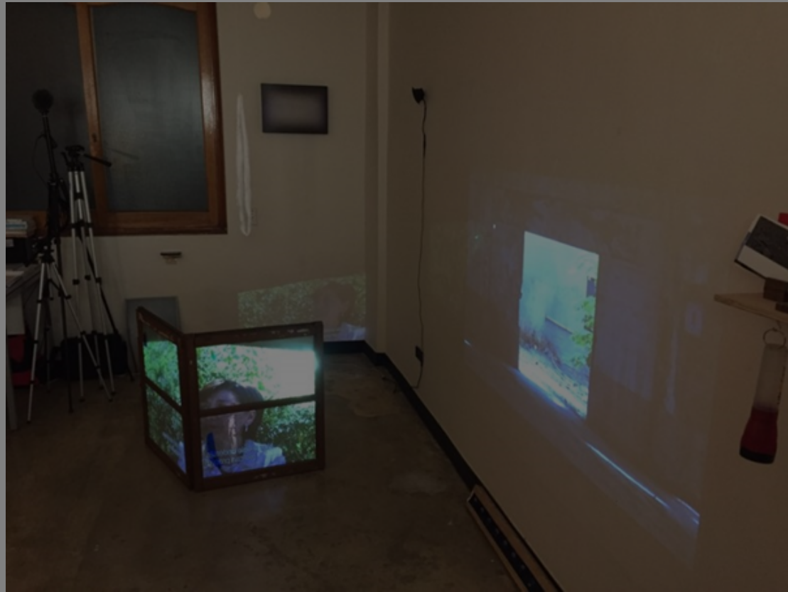
Exhibition at Suncheon Urban Regeneration Art Village