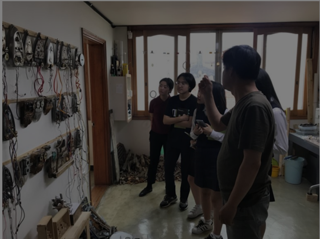
Exhibition View at Suncheon Urban Regeneration Art Village

DK: Artists are conducting community-based activities within their areas of specialisation. For instance, some artists used a small garden to cultivate and harvest crops with the community members, creating opportunities for sharing and communication. Artists also participate in civic community events such as local festivals and cultural events. Last year, two artists from Thailand who participated in the short-term residency and the artists-in-residence gathered to run a program called 'One minute portrait'. I would say it was a great chance to explain naturally about the Suncheon Art Village to the citizens. There were many other workshops besides the ones mentioned above, which were conducted in collaboration with artists. They are not limited to the visual arts field.