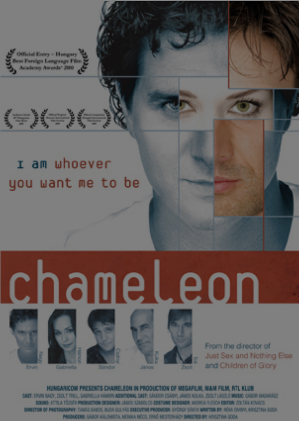
[caption id="attachment_1061" align="alignright" width="302" caption="Poster of Chameleon"]