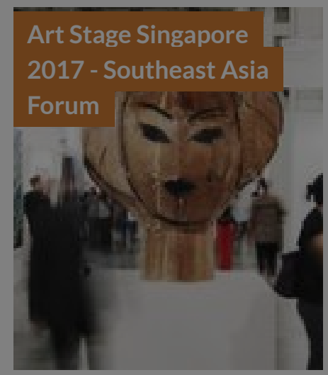
POSTED ON 06 SEP 2010