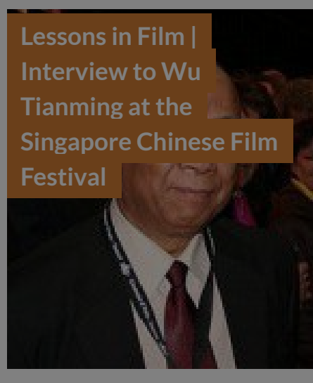
POSTED ON 13 JAN 2015