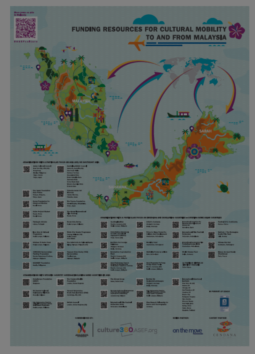
Join us on 14 March 2019 in Kuala Lumpur for the launch event.

Since 2012, the <u>Asia-Europe Foundation (ASEF)</u> and <u>On the Move (OTM)</u> have jointly presented the <u>Mobility Funding Guides for the 51 countries</u> of the <u>Asia-Europe Meeting (ASEM)</u>. From 2018, ASEF has initiated a new approach for the Asian Guides that is involving local content partners in the research process. The Mobility Funding Guides have been recognised by UNESCO in its 2018 Global Report as a "comprehensive and updated list [...] for the cultural mobility of artists and cultural practitioners in Asia and Europe". Further, by providing free access to these series of country-focused guides on culture360.ASEF.org, ASEF contributes to the pursuit of the Sustainable Development Goals (SDGs).