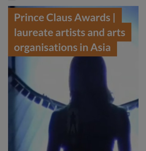
POSTED ON 02 OCT 2013