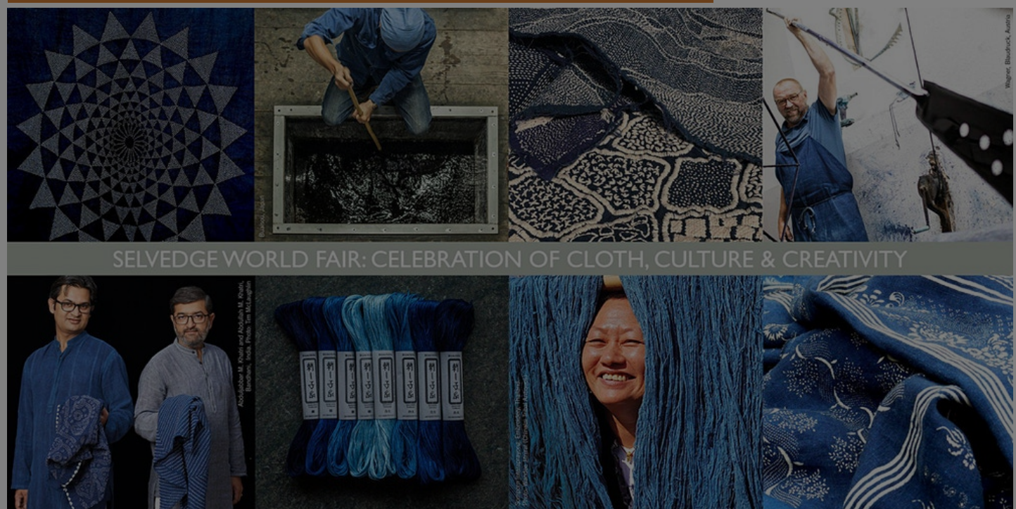
SELVEDGE WORLD FAIR: CELEBRATION OF CLOTH, CULTURE & CREATIVITY

The Selvedge World Fair is a 3-day virtual event, a celebration of cloth, culture and creativity , that will present the work of master artisans, bringing together varied - and in some cases endangered - textile traditions from around the world. Visitors will be able to buy handmade treasures, take part in online workshops and watch and participate in talks on textile-related themes. Expect indigo dyers from Japan, baskets makers from Swaziland, and rug weavers from Uzbekistan and many more.