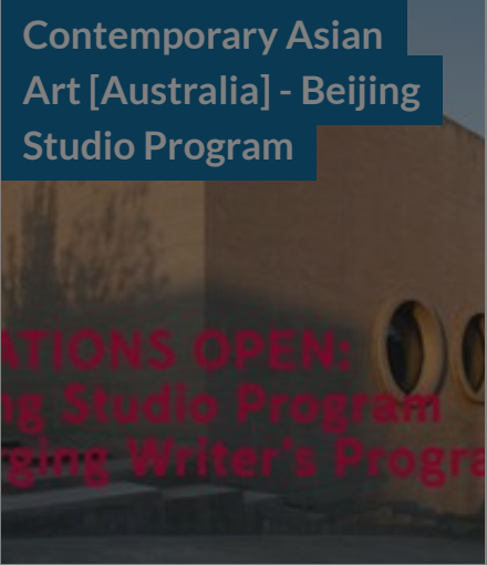
Contemporary Asian Art [Australia] - Beijing Studio Program