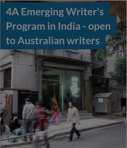
4A Emerging Writer's Program in India - open to Australian writers