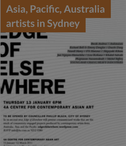
Asia, Pacific, Australia artists in Sydney