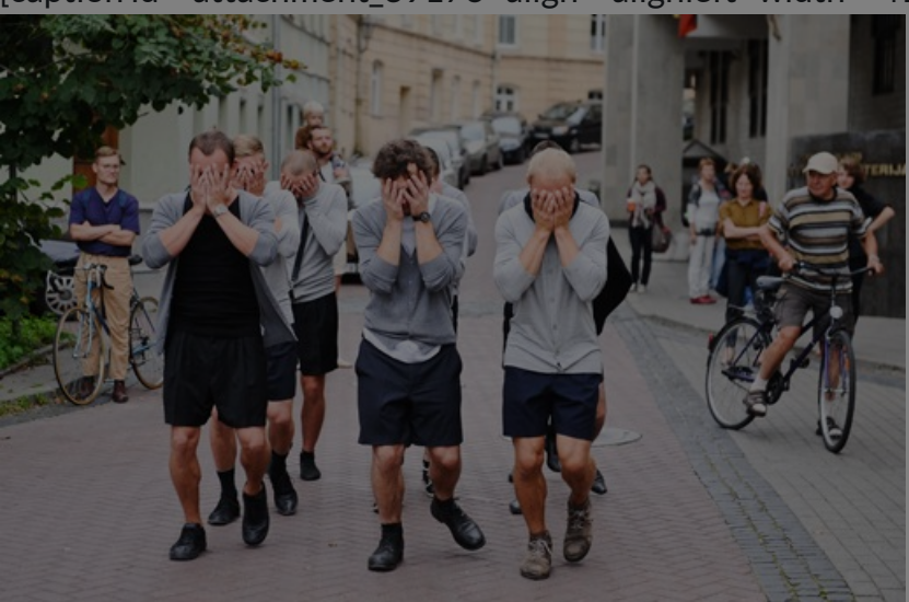
Eglé Budvytytė | Choreography for the

Running Male, 2012, performance, 30 mins | Courtesy the artist | Photograph: Ieva Budzeikaite | Commissioned by Contemporary Art Centre, Vilnius[/caption]