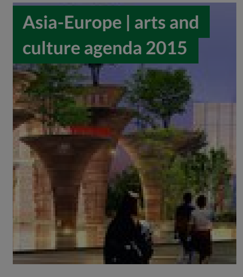
POSTED ON 23 APR 2012