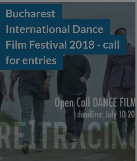
POSTED ON 06 JUN 2023