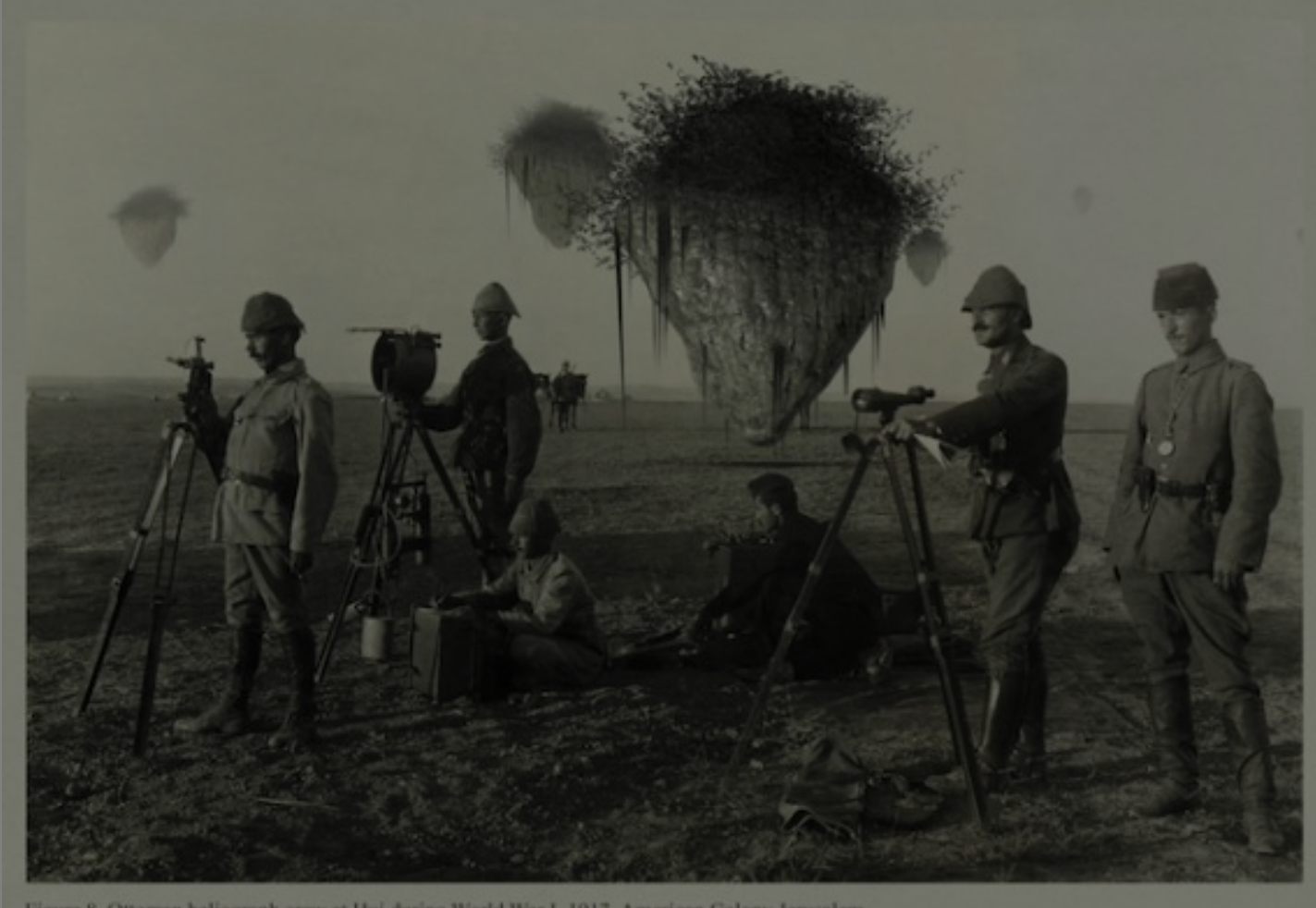
Figure 8. Ottoman heliograph crew at Huj during World War I, 1917.