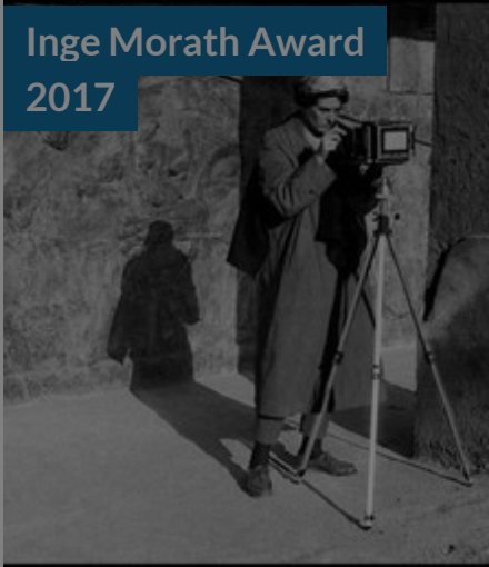
Inge Morath Award 2017