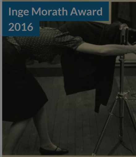
Inge Morath Award 2016