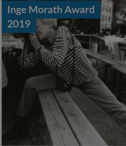
Inge Morath Award 2019