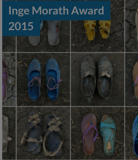
Inge Morath Award 2015