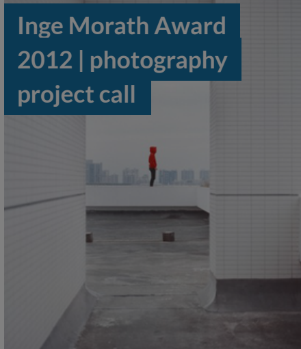
Inge Morath Award 2012 | photography project call