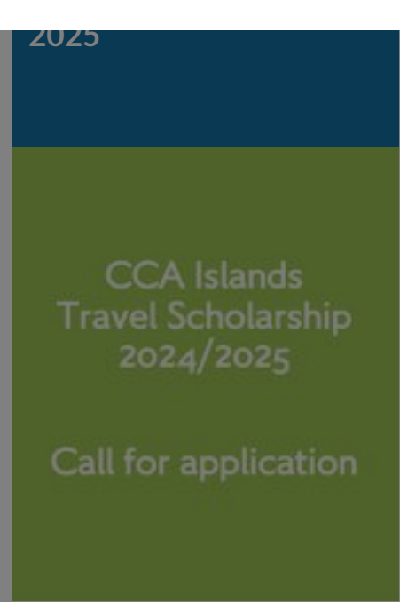
RESIDENCIES INTERNATIONAL JAPAN