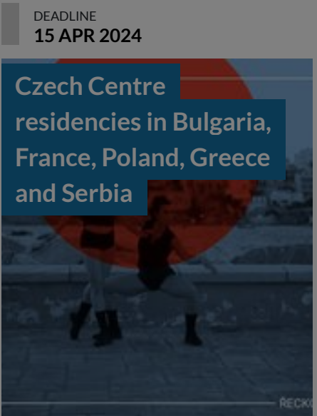
RESIDENCIES BULGARIA CZECH REPUBLIC