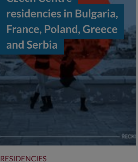
FRANCE GREECE POLAND