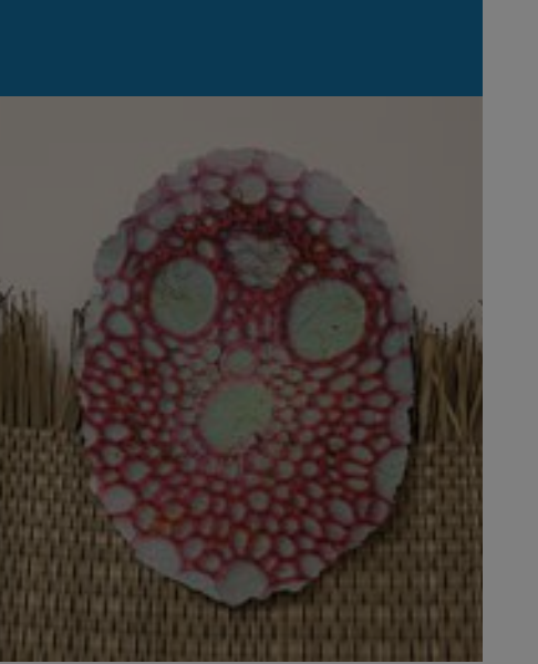
RESIDENCIES NEW ZEALAND UNITED KINGDOM