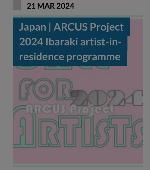
RESIDENCIES INTERNATIONAL JAPAN