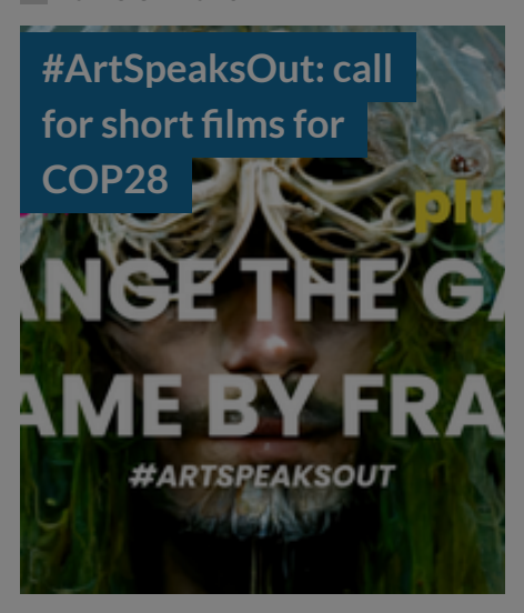
POSTED ON 18 OCT 2023