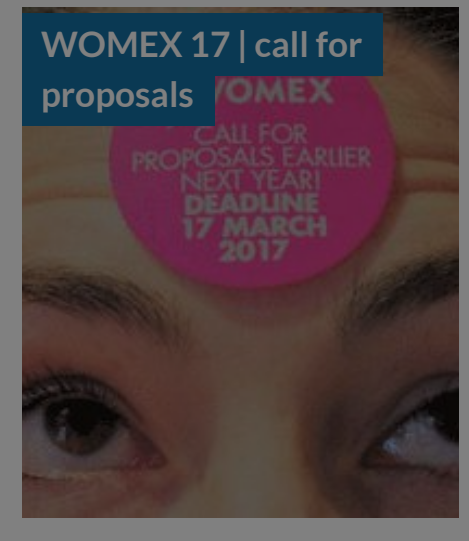
POSTED ON 18 FEB 2016