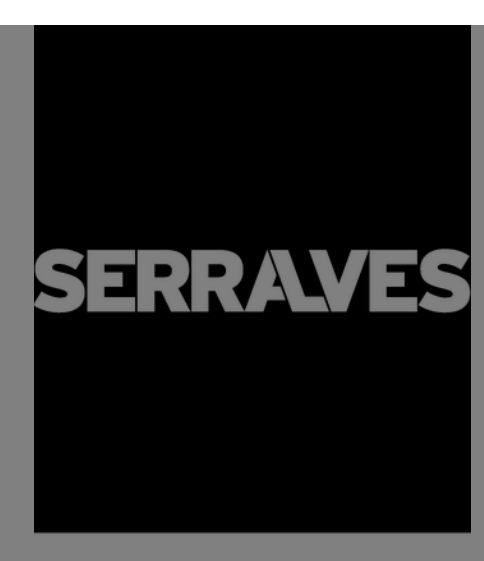
POSTED ON 28 NOV 2016