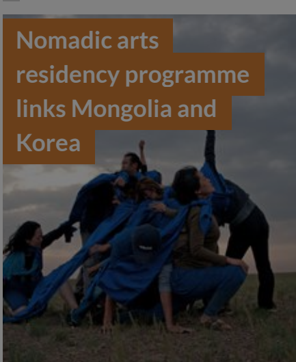
POSTED ON 17 NOV 2014