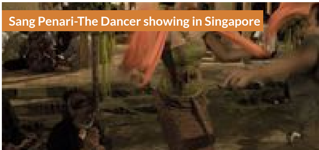
Sang Penari-The Dancer showing in Singapore