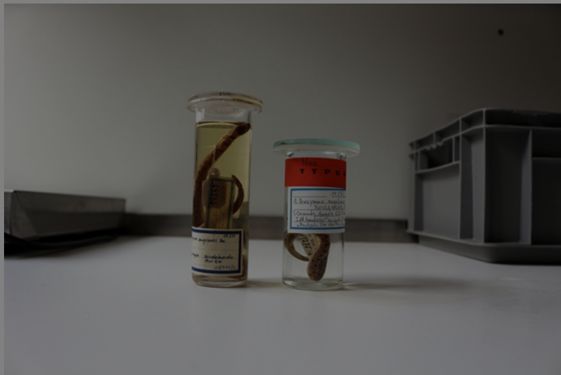
Image from the multimedia series, Scientific Method, featuring specimens from the Department of Herpetology of the Natural History Museum, Vienna.