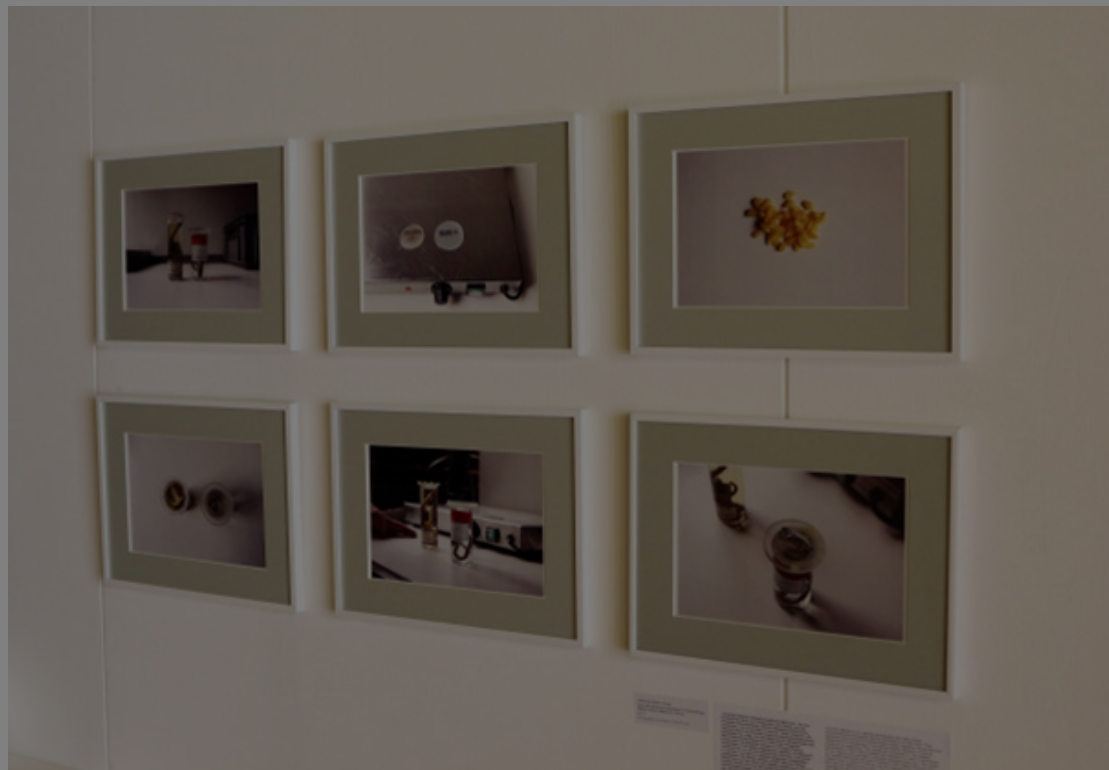
Photographs from Scientific Method exhibited at the Federal Chancellery