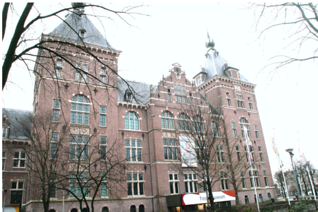
1. Tropenmuseum building in Amsterdam, The Netherlands

Before moving to Amsterdam, the Tropenmuseum (The Museum of the Tropics or Tropical Museum) first opened in Haarlem in 1871 as “the Colonial Museum”, with colonial propagandistic motives at the time: convincing people of the benefits of the colonies which included Indonesia. The collection consisted of trade products as well as artefacts originating from private collections of Dutch colonisers and missionaries who brought back “curiosities” from the colonies. In 1949, 4 years after Indonesia’s independence, the museum was renamed the Tropenmuseum and focused on collecting artefacts from the rest of the tropics, in an attempt to distance itself from its colonial past. Nevertheless, as the museum was the focus of national and international protests, an unilateral Governmental decision was made to stop financing it. Such a decision overlooked the museum’s efforts of changing the collections’ colonial roots narrative, including through encounters with contemporary arts. Tropenmuseum survived thanks to the merge in 2014 with other Dutch ethnological museums - the Museum Volkenkunde (Ethnology Museum) in Leiden and the Afrika Museum in Berg en Dal - to become the Nationaal Museum van Wereldculturen (National Museum of World Cultures).