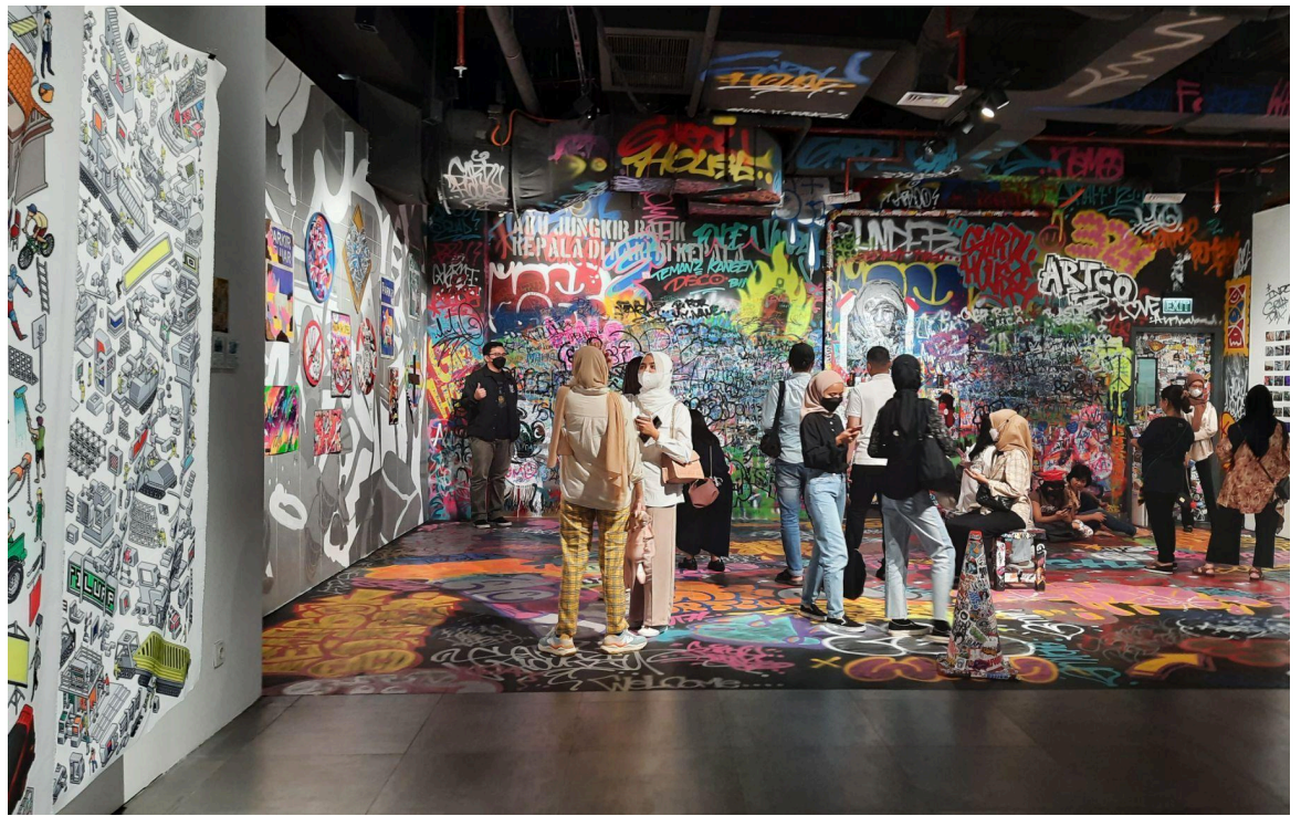
2. One of the favoured photo spot in front of a collective artwork by Gardu House at "Distrik Seni x Sarinah" © 2022 by Savitri Sastrawan

According to Rizki, Farah and Sadiyah, taking Instagrammable photos at art exhibitions held in Jakarta's heritage spaces might be a positive sign, but there are more important ways to measure its success.