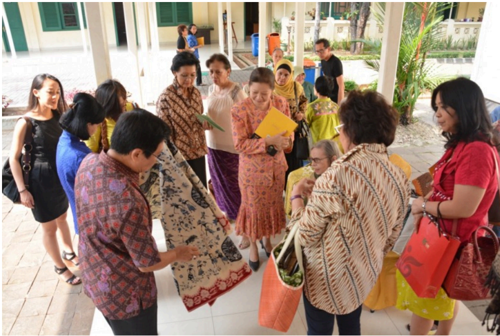
Batik experts and Batik lovers during sharing session during break time[/caption]

"We were excited to share the passion on our Batik collection in Indonesia. At the same time, we felt very nervous because Batik is an integral part of Indonesia's cultural heritage and people's everyday life."