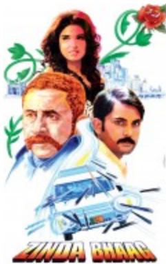
'Zinda Bhaag' Movie Poster[/caption]

[caption id="attachment_9517" align="alignleft" width="120"]