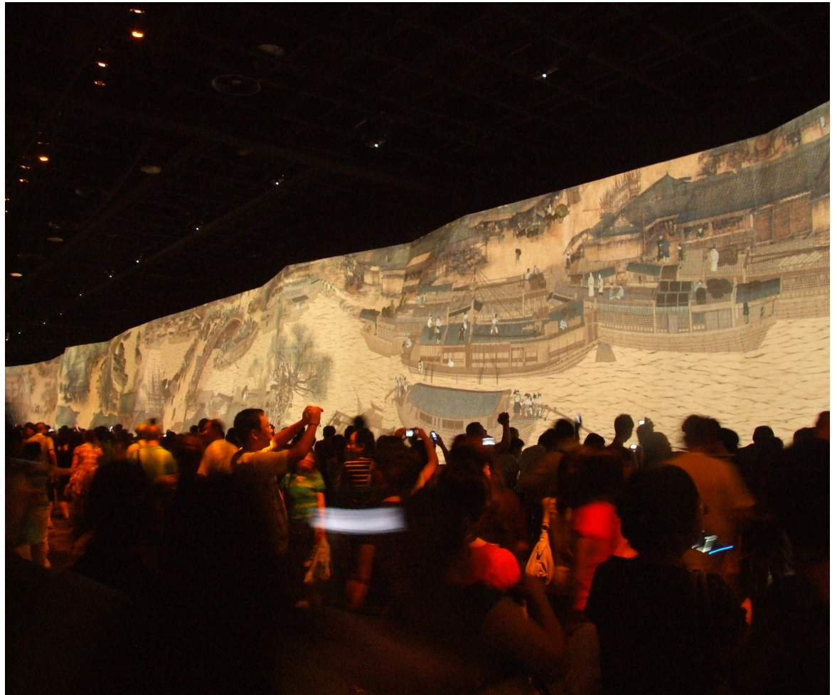
3. The animation based on the historic Chinese painting Along the River During the Qingming Festival in Expo 2010, Shanghai.

A decade before Keane Tan's win, the 2010 Shanghai Expo with the theme: "Better City - Better Life" showcased what they termed a 'digital tapestry' recreated from the original panoramic painting, 'Qingming shanghe tu' (Along the River During the Qingming Festival). The company Crystal CG produced a 6.3m tall animated, digital mural that projected across 130m. 9 New elements consistent with the old iconography including people, trees, animals, houses scaled up the original scene into a dynamic and larger composition. The display enabled the scenes to appear as both daytime and nightfall. To create such an environment, modeling and coding are interwoven in a cross-platform engine such as Unity 10 , reinterpreting the original, static painting on silk into animation.