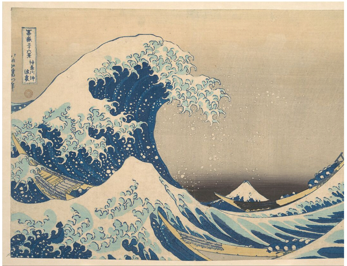
2. Katsushika Hokusai, Kanagawa-oki Nami Ura, c. 1830-1832, nishiki-e, H. O. Havemeyer Collection, Bequest of Mrs. H. O. Havemeyer, 1929, Metropolitan Museum of Art

It is likely other sets of data were fed to the generator, for example, the words 'dramatic' or 'cinematic' which appear in the title of the work. Further interventions in machine learning can refine aspects of how the algorithm processes data. The algorithm can also shift by recognising patterns and association: for example, to use the word 'shipwreck' beside 'cinematic'; 'dystopian' beside 'drama' or 'cinema'. 7