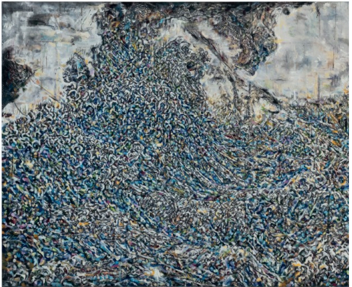
1. Keane Tan, A Dramatic Cinematic for Our Century , 2021, Oil on Canvas © UOB Painting of the Year 2021

Despite the inscrutable names, in machine learning contexts, this kind of AI generator is simply fed data sets, which may involve a series of words, descriptions, original images for example. The generator then produces an image that is the result of compositing all the data sets fed. In the case of Keane’s work, there is an obvious reference to Edo era printmaker, Hokusai’s “Kanagawa-oki Nami Ura” or “Great Wave of Kanagawa”.