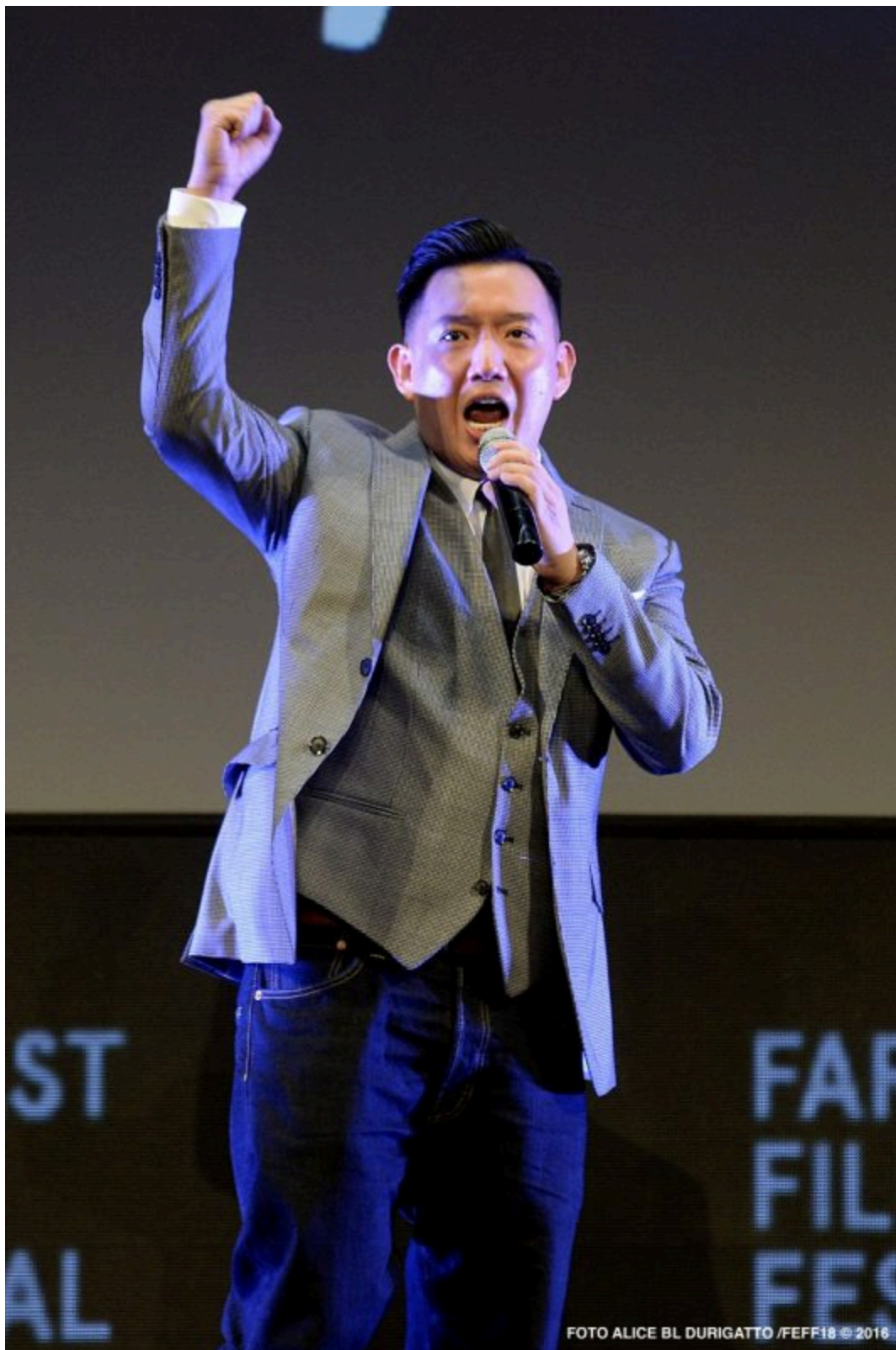
Chapman TO, actor[/caption]

Acclaimed Hong Kong actor Chapman TO has been another regular visitor over the years. He says has always enjoyed meeting fans who might have a different view of his work than the one he hears about back home.