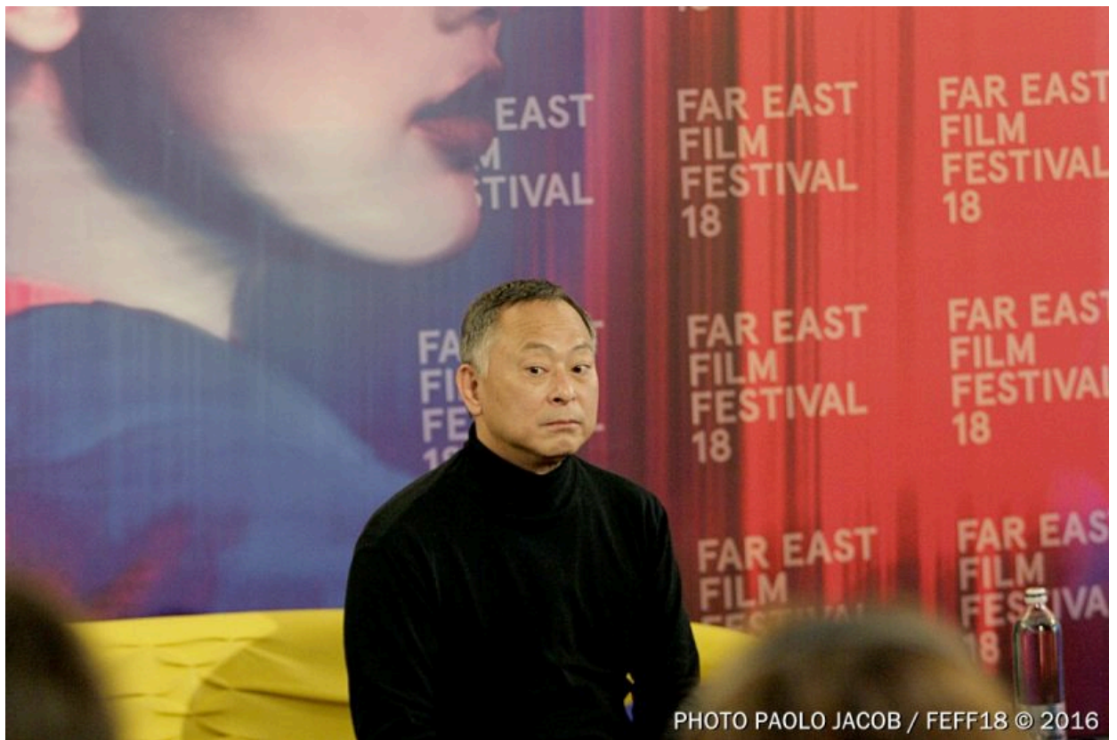
Johnnie TO, Director[/caption]

The Far East Film Festival (FEFF) has been devoted to reducing the cultural distance between the East and the West for 18 years. By showing films which are popular in Asia but are not easy for Western audiences to see , and genre films that are rarely watched by an international audience, FEFF has established itself as an iconic Asian film festival in Europe.