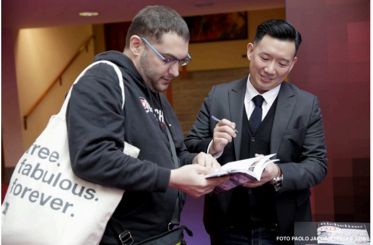
Chapman TO, actor[/caption]

[caption id="attachment_58722" align="alignnone" width="620"]