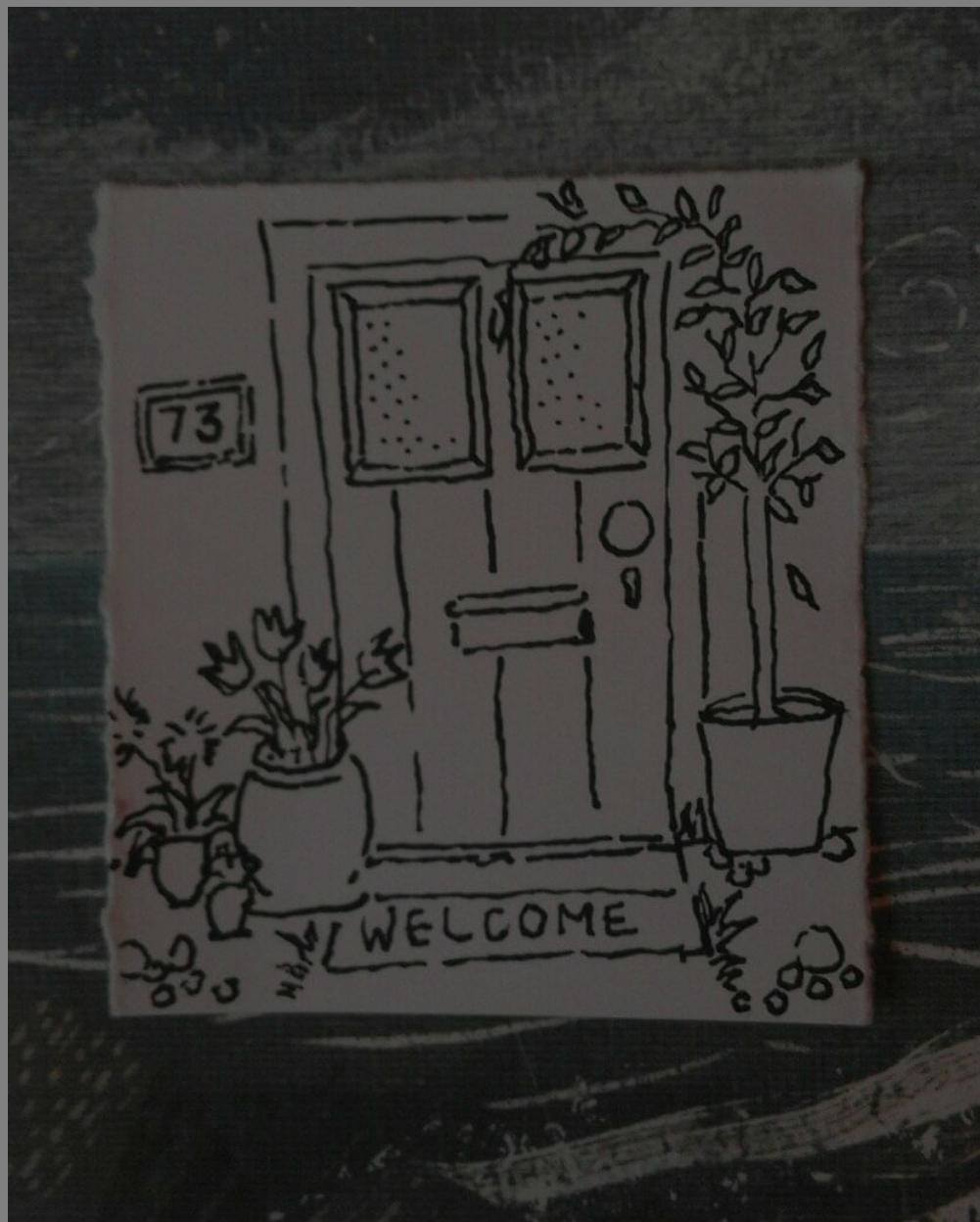
Photo: My home is

It was delightful to see the creative, colourful, hopeful response from all our members – all our members took part at least once. A WhatsApp group was soon created as a supplementary medium for these creative exchanges and for making new suggestions for themes. This increased the engagement level dramatically and helped unleash the creative self in each one of us.