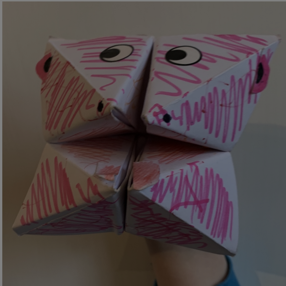
Photo: Something with a face scavenger hunt

It all began with 3 people who met in a digital storytelling workshop about mental health run by an academic institution. We decided to stay in touch, and we used to meet regularly for peer to peer support. Whether in public libraries, community centres or public gardens, the company of peers sharing about their mental health journey offered comfort. As our group kept growing, some of us volunteered to organise a film screening evening or a self-help book club or teach a tai chi lesson for calming down.