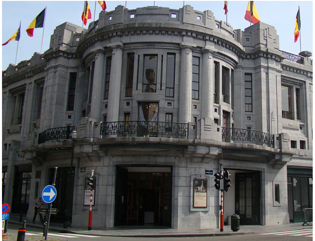
Centre for Fine Arts-Brussels (BOZAR)

Amb WARNECKE: In the context of the growing discussions on the role of culture in EU international relations, how do you see artists and State actors working together? Can cultural diplomacy goals ever be compatible with artistic visions?