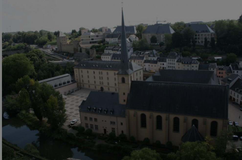
The Neumünster Abbey

[caption id="attachment_38731" align="aligncenter" width="496"]