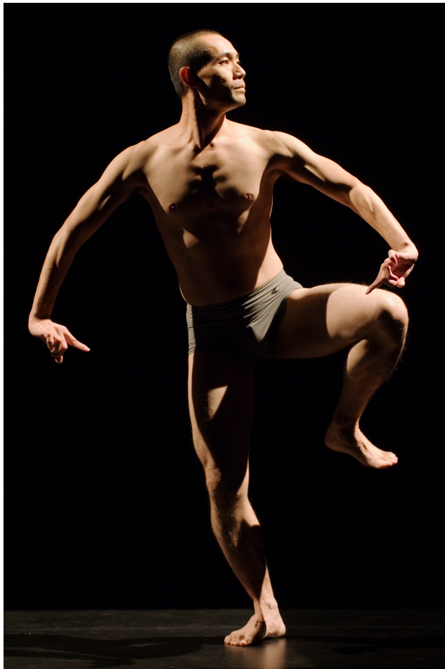
Pichet Klunchun in 'I am a Demon'

'I am a Demon' was created in 2005. It looked at the intricacies of Khon dance through a contemporary lens. As someone who has constantly been working in a multi-cultural environment, could you tell us about how your process of creation has been influenced over the years by the exposure to varied cultures?