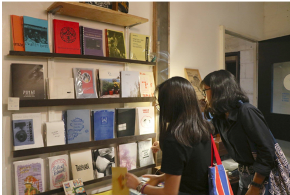
Studio Soup Library