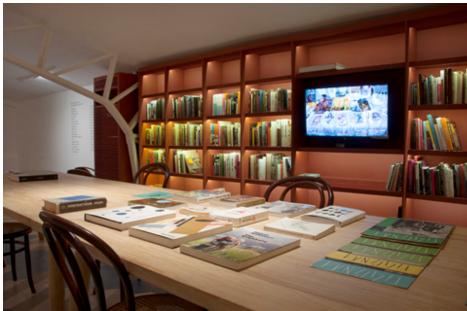
Bellas Artes Projects Outpost