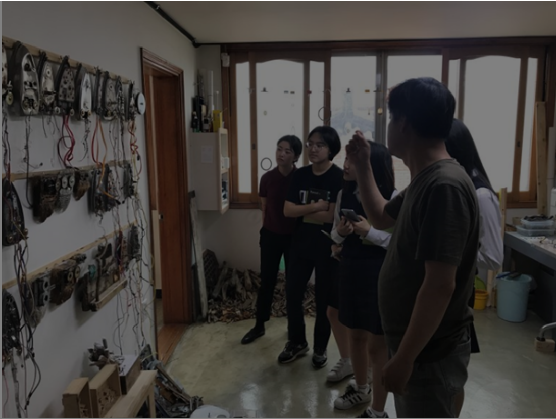
Exhibition View at Suncheon Urban Regeneration Art Village

DK: Artists are conducting community-based activities within their areas of specialisation. For instance, some artists used a small garden to cultivate and harvest crops with the community members, creating opportunities for sharing and communication. Artists also participate in civic community events such as local festivals and cultural events. Last year, two artists from Thailand who participated in the short-term residency and the artists-in-residence gathered to run a program called 'One minute portrait'. I would say it was a great chance to explain naturally about the Suncheon Art Village to the citizens. There were many other workshops besides the ones mentioned above, which were conducted in collaboration with artists. They are not limited to the visual arts field.