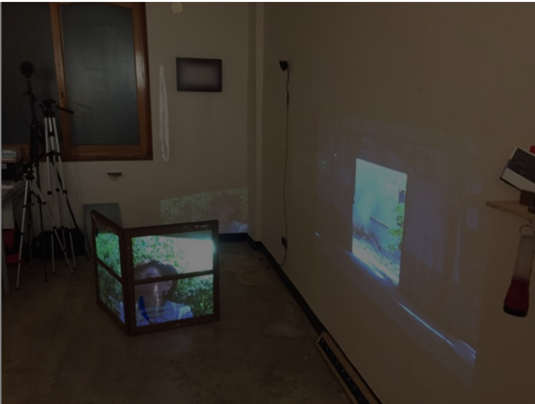
Exhibition at Suncheon Urban Regeneration Art Village

MC: This means that participating artists could be the main agents of community, who lead the citizens through arts. For instance, they seem to be actively communicating with the local residents through some programmes such as 'Art Village Open Studio', 'Up-cycling Art Workshop', 'Residency Festival' or 'Sharing the Kitchen'. How do you evaluate each program and the community's artistic scene today?