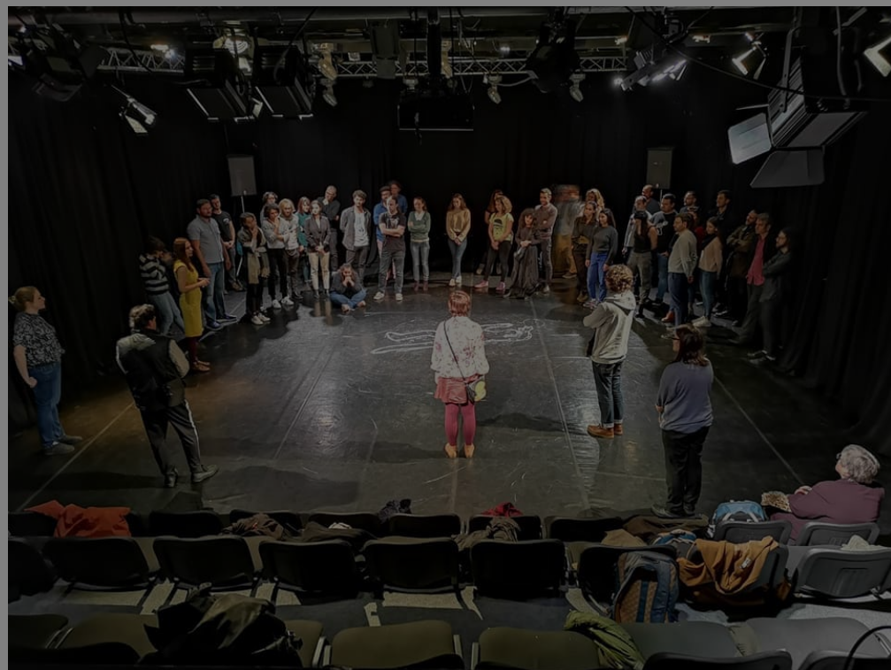
Hour of Truth - a performance by Radar Sofia with Venice Biennale winner Vaiva Grainyte and local writers, 2019.

Some art institutions reacted to the crisis by moving their activities online while keeping the pace of the production – the capitalization of the immaterial space of the internet has been happening hand-in-hand with globalization and we suddenly find ourselves in an oversaturated online reality which devalues artistic facts. We all know how social media have been exploiting us and our data, making us work for free and we don't need artist residencies to start doing the same. The online efforts of some big foundations who stepped up to support or replace governments in providing emergency funding ( KONE , Onassis ) deserve praise – they distribute grants with almost no strings attached instead of focusing on extracting content for online platforms.