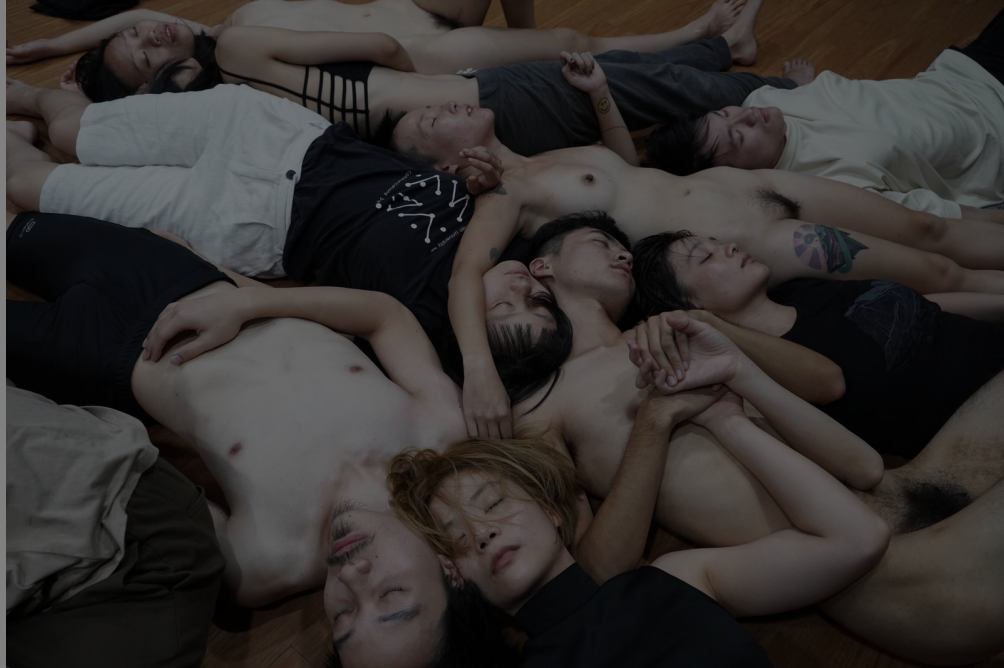
Impossible actions - workshop and performance with 11 local Taiwanese artists at Taipei Artist Village, 2019.

Residencies often come with regulation on themes, methods and type of work and thus shape artistic production. Before expecting of them masterpieces, market success, cutting-edge research, and critical acclaim, institutions should talk to artists on what type of support they really need and invent tailor-made residencies around their needs instead of asking them to fit guidelines and priorities. Can they create long-term engagements , with contracts, salaries, benefits and support that could make a considerable change on one's career instead of offering precarious one-two months of (un)paid freelance work in another location thousand kilometers away?