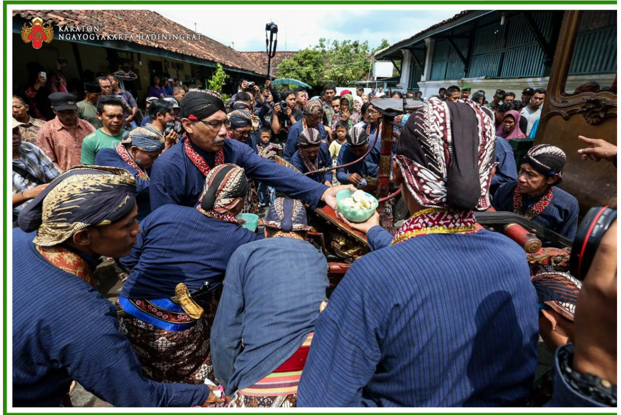
Kanjeng Nyai Jimat being prepared for Jamasan at the Royal Carriage Museum of Yogyakarta