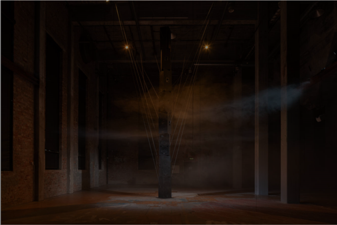
A Soul Transplant 2019 by Vivian Caccuri

While these two examples share a commonality in terms of geographical distance, it becomes obvious that connecting the local with the global through different gestures, no matter how small they may seem at times, can be beneficial for everyone. Enabling artists and communities to reflect on their own experiences, locally and sharing that experience further, is almost vital for sustaining the communities in the peripheral areas and raising awareness on certain issues, while at the same time supporting different artistic practices.