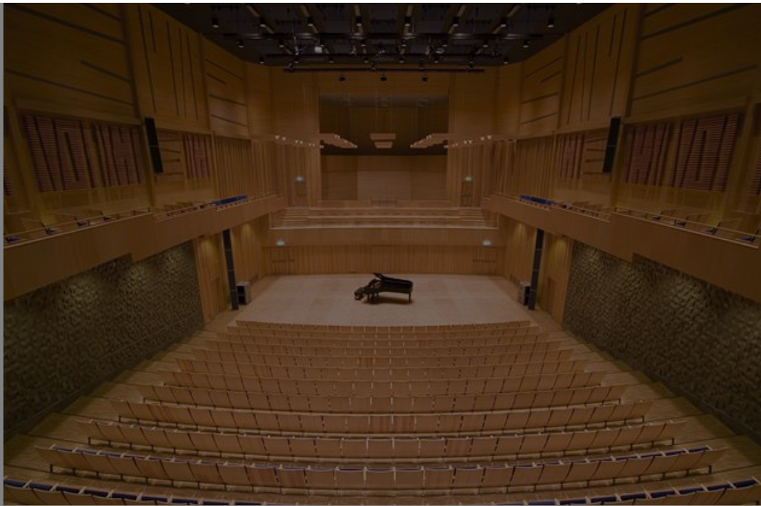
Studio Acusticum, Piteå, Sweden

Hanna Isaksson agrees with the importance of working with international artists, and in the case of Swedish Lapland AiR, networks as well. According to her, if you are located in the periphery, it is imperative to collaborate with artists and organisations out of your geographical zone. For example, after visiting a sound residency in Canada, she turned to Studio Acusticum , a multifunctional space located in Piteå, Sweden.