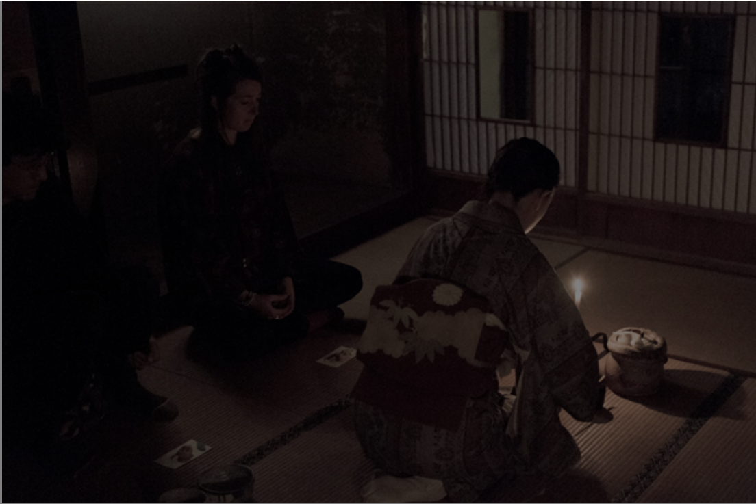
Shiro Oni Studio, Tea Ceremony at the Kinuya Building

The organisers of this residency, being aware of the deep attachment of the regional people to their place, natural environment and their communities, are organising different workshops to introduce the international artists to Japanese rural culture. These workshops are also about learning specific local crafts, like Japanese tea ceremony, straw rope making, zen meditations etc., depending on the artists' interests. This not only gives a direct participation in the community for the artists, but also on some level, supports the local tradition and economy, which shows how meaningful it is for institutions in peripheral areas to be able to work with international artist or cultural professionals.