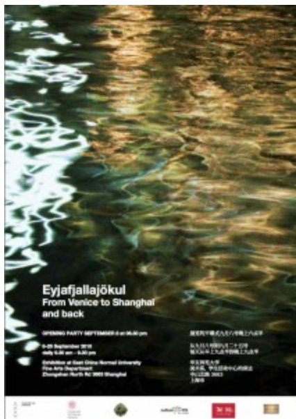
Eyjafjallajökul - From Venice To Shanghai

and Back suggests a cultural dialogue between the two cities of Shanghai and Venice, through two exhibitions: the first one about Venice, taking place in China, and the second, about Shanghai in Italy.