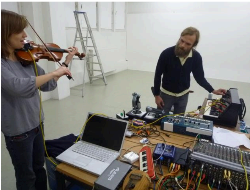
I invited artists

whom I have met or who were recommended to me. It really is an intuitive process to put together a group of people. I found it important to have one person from each of the previous two editions for the third edition in Leuven. But the focus was on getting artists from different disciplines who could collaborate together and also have a mixture of younger and older, more experienced artists.