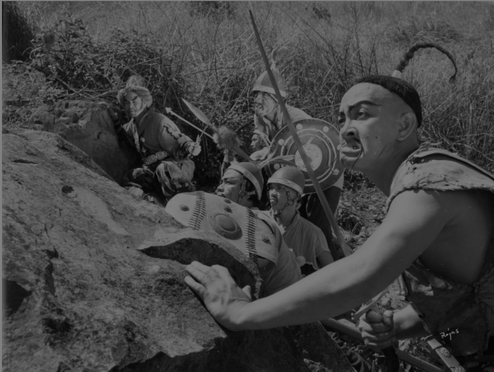
“Genghis Khan”, film still,

[caption id="attachment_52075" align="aligncenter" width="496"]