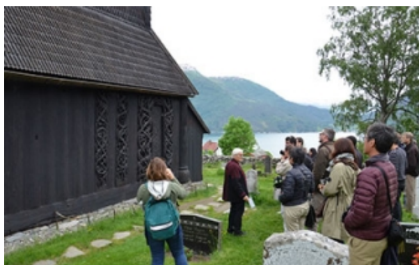
The 19th International Course

on Wood Conservation Technology - ICWCT 2020 will be held between 14 April and 16 June 2020. The course includes an online distance learning segment (14 April - 26 May) and a workshop that will take place at Riksantikvaren - the Directorate for Cultural Heritage, Oslo, Norway (2-26 June). ICWCT 2020 is organised by the International Centre for the Study of the Preservation and Restoration of Cultural Property - ICCROM, Riksantikvaren - The Directorate for Cultural Heritage in Norway, and the Norwegian University of Science and Technology - NTNU.