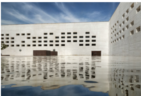
The EMYA Judging Panel was

delighted to announce the Museo de Madinat al-Zahra in Cordoba in Spain as the European Museum of the Year 2012 for its outstanding achievements for public quality and excellence. The Museum encompasses the important archaeological site of the 10th century capital for Muslim al-Andalus and a new museum building that serves as a research centre, visible storage, conservation and restoration facility, and as a space for exhibition and interpretation of a unique collection. The museum and the partially recovered and restored site document a magnificent, complex city, its supporting infrastructure, buildings and gardens, as well as the social organisation and everyday life of its 10,000 inhabitants. The Madinat al-Zahra Museum functions as a visual memory of the mixed and plural past of Andalusia, and thereby as a potential bridge between different cultures also in contemporary Europe. In every aspect of its work this museum displays a high level of excellence. See images of Museo de Madinat al-Zahra .