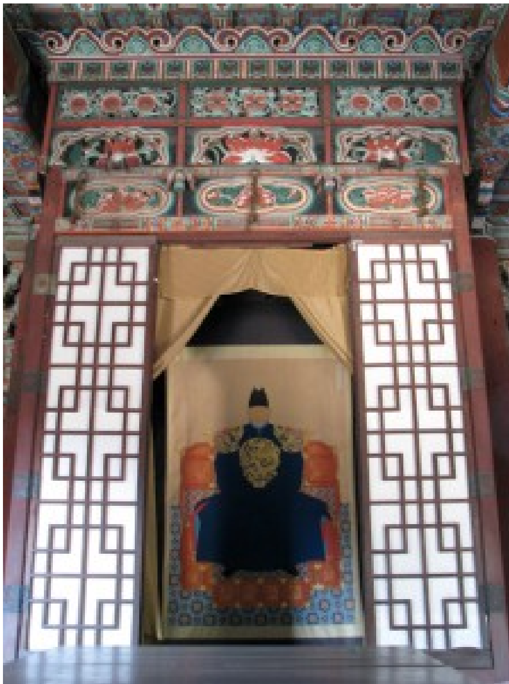
[caption id="attachment_23690" align="alignleft" width="224" caption="Jeonju, Korea"]