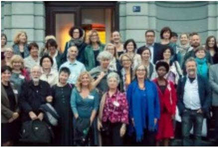
The International Committee for

Museums of Ethnology (ICME) , one of the international committees of the International Council of Museums (ICOM), will hold its 2015 annual conference from 21 to 23 October in Hanoi, Viet Nam . This year's conference is entitled " Museums and Communities: Diversity, Dialogue, Collaboration ". It will address the contemporary museum's concern with power, representation and affect. Specifically, the conference will consider the transformation of exhibition spaces from sites where knowledge is transmitted to passive audiences towards potential contact zones or forums where diverse community voices and visibilities are raised and new knowledge(s) actively constructed in on-going dialogue . Conference organisers have launched a call for ICME fellows as well as a call for papers. In the context of the call for fellowship funding , 3 ICME fellows from individual members of ICME from developing nations or ICME youth members will be selected to attend the conference. Applicants shall be engaged actively in curatorial, education, research or developmental work in a museum. Applications should be sent by 30 April. On the other