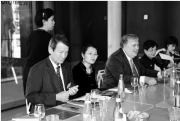
The ASEMUS Executive