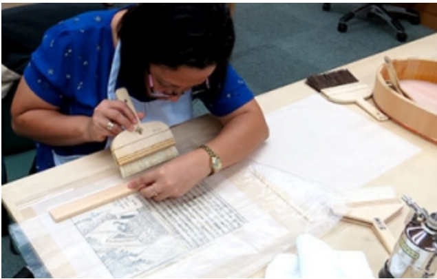
ICCROM and Japan's

National Research Institute for Cultural Properties are organising a new edition of the International Course on Conservation of Japanese Paper , which will be held in Tokyo between 27 August and 14 September 2018 . Japanese paper is internationally recognized as a superior conservation material. However, outside of Japan, it is difficult to gain systematic, holistic knowledge and experience in Japanese paper and Japanese traditional techniques. In this course, a better understanding of the Japanese conservation tradition will be offered to participants from overseas. In addition, the course aims at providing opportunities to build bridges between Japanese and Western paper conservation and to encourage application of Japanese conservation approaches, materials and techniques to non-Japanese cultural heritage as well.