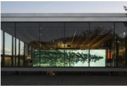
The Stiftung Wilhelm Lehmbruck

Museum - Zentrum Internationaler Skulptur , in Duisburg, Germany, has recently launched a call for an International Fellow / Junior Scholar whose primary field of expertise is audience development, communication and curatorial work. The international fellowship is supported by the International Museum Fellowship Programme of Germany's Federal Cultural Foundation. The aim of the Fellowship at the Lehmbruck Museum is the conceptual development and enhancement of better and more effective outreach measures for the museum . Specific responsibilities include the implementation of analyses of visitor demands and orientation as well as the development of own ideas and innovative instruments to improve audience outreach activities. The fellow will be able to work with a renowned collection and well-established exhibition and communication structures . The result will be an audience orientation concept dedicated to optimising the development of (new) audience groups for the Lehmbruck Museum. Further, research results and insights will be made available to other museums via a symposium accompanied by a published documentation. This will give the fellow an opportunity to build a broad cultural and tourist network.