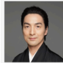
Rankoh Fujima Japanese classical dancer