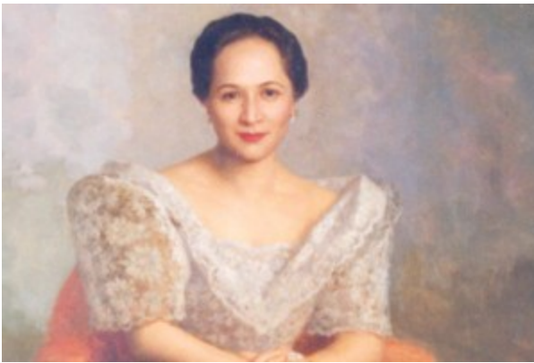
Fernando C. Amorsolo (1892-

1972) was a famous artist who dominated the Philippines art scene for four decades, known for his mastery in the use of light. Educated first in the Liceo de Manila, he then attended the fine-arts school at the University of the Philippines, graduating in 1914. His works covered a wide range of subjects, from rural picturesque scenes to large historical paintings. Amorsolo was however, most known as a portraitist. His works are collected by various museums and collectors. Portraits made up a large proportion of his works. They were mostly commissioned works depicting leaders in society and industry and their loved ones, as well as Americans residing in Manila during the American colonial period. The exhibition at the Ayala Museum focuses on portraits by Amorsolo.