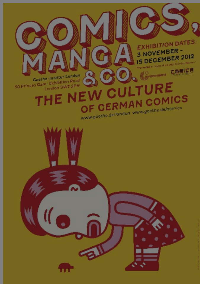
Comica Festival 2012, the 9th London International

Comics Festival, offers a season of major British and international guests, with exhibitions including spotlights on German and Korean comics. The festival runs 2-30 November and includes the free-entry Comiket Fair and Transitions Conference, plus numerous satellite events across the capital. The free exhibition Manhwa Korean Story & Painting: 2012 The Colours of Korean Comics unveils a variety of interesting and unique paintings from famous Korean comics, cartoons and webtoons. The Korean Culture Centre (KCC) in London will be hosting the exhibition (till 21 Nov) to showcase selected works of Korean comic artists providing an insight into Korea's diverse history and culture. Conceived by the Goethe-Institut and Matthias Schneider, Comics, Manga & Co. The New Culture of German Comics presents two generations of German comics artists: the avant-garde that paved the way for the emergence of an independent culture of German comics, and a generation of younger comics artists whose work embraces new aesthetic and narrative aspects. The exhibition is on till 15 December. To learn more about comic art in Europe, check out European Comic Art , the first English-language scholarly publication devoted to the study of European-language graphic novels, comic strips, comic books and caricature.