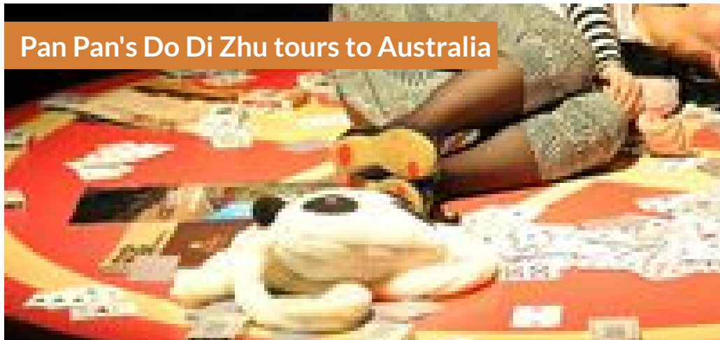
Pan Pan's Do Di Zhu tours to Australia