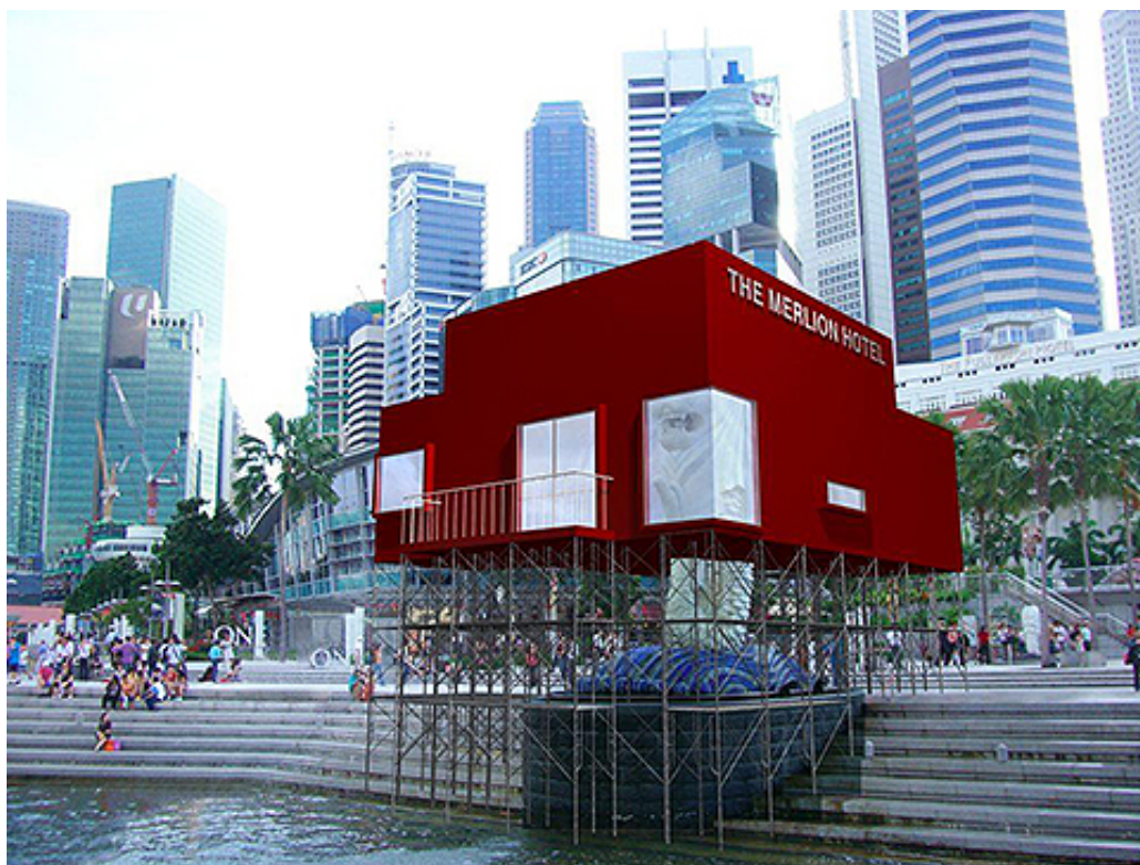
[caption id="attachment_8060" align="alignright" width="434" caption="The Merlion Hotel (artist's rendering), 2011.